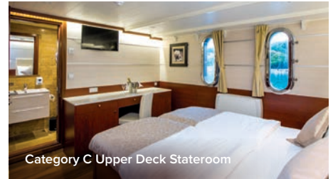
Category C Upper Deck Stateroom