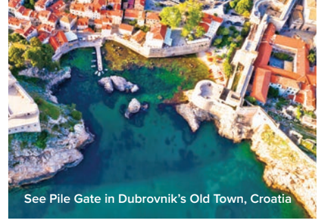
See Pile Gate in Dubrovnik's Old Town, Croatia